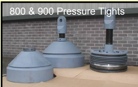
800 & 900 Pressure Tights