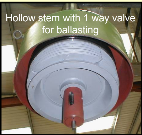
Hollow stem with 1 way valve for ballasting