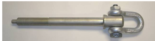
Heavy Duty Eyebolt with 17t Shackle

Brewis Engineering Limited Handlemaker Road Marston Trading Estate Frome Somerset UK BA11 4RW