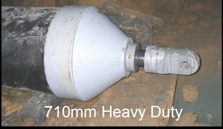
710mm Heavy Duty